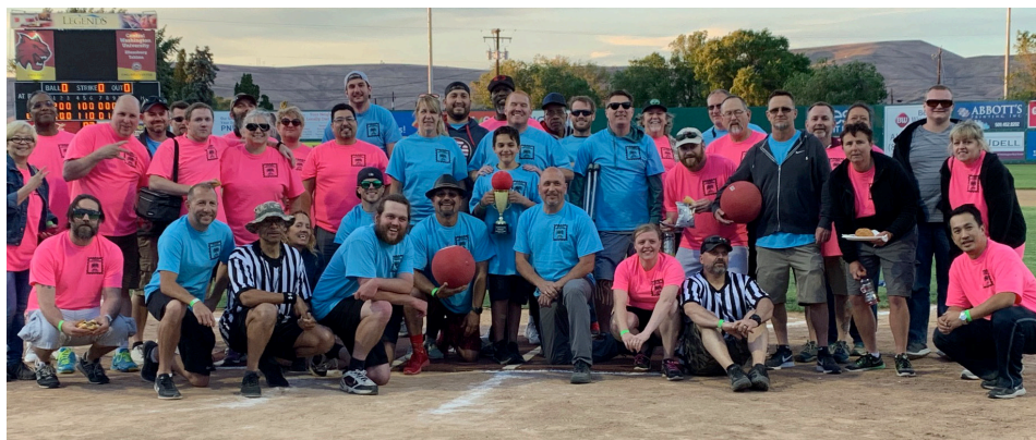
Second Annual WSALC East - West Kickball Teams (for the full effect of "Pink vs Blue" see the color version at wsalc.org )

Thanks again for all your hard work in your communities!