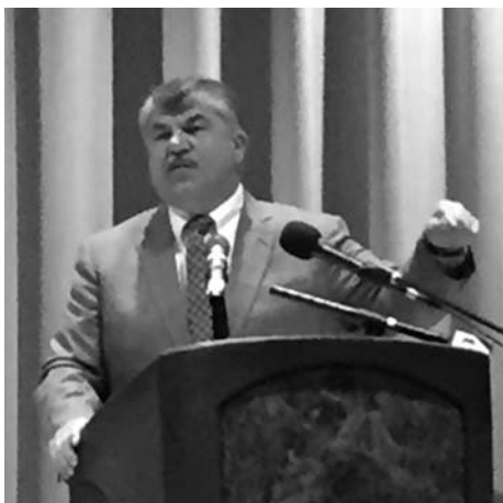
AFL-CIO President Trumka addresses the delegates